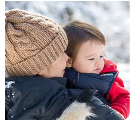
Winter is a great time for indoor & outdoor development-boosting activities!

In this article, we're sharing nine things that parents can do with their young children this winter—to bond with them and boost their development. These suggestions were inspired by and adapted from the ASQ-3 Learning Activities and the ASQ:SE-2 Learning Activities . Share this article with parents of young children (especially #9, which includes a link to fill out an ASQ questionnaire for free!) and help them create some awesome winter learning experiences with their kids! ( Don't forget that activities should be supervised at all times by an adult. Any materials given to a young child should be reviewed for safety. )