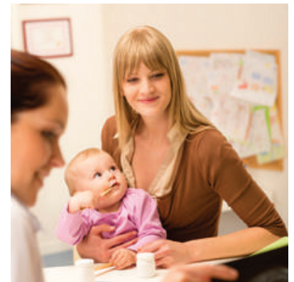
Even seasoned ASQ users sometimes make these common mistakes.

Occasionally parents skip items on the questionnaire. This could be because the item is inappropriate to their culture or family values, or they are concerned about their child's behavior, or perhaps they just don't know how to answer. It's important to make sure that children aren't penalized for omitted items.