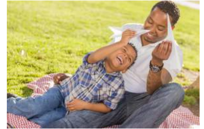
SEAM provides in-depth social-emotional information and optimizes positive parent-child interactions in the first years of life

TIP: Recognize caregiver differences. Not everyone will feel the same level of comfort or candidness. Keep in mind that a person's individual culture, values, parenting style, and other characteristics or may affect how they respond to the process, and to the assessment items. Get to know them, ask questions, and be open-minded.